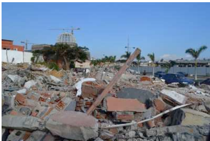
The ruins of a recently demolished neighborhood. The residents were moved to a state rehousing zone, Zango. Photograph by the author, Luanda, May 2012.