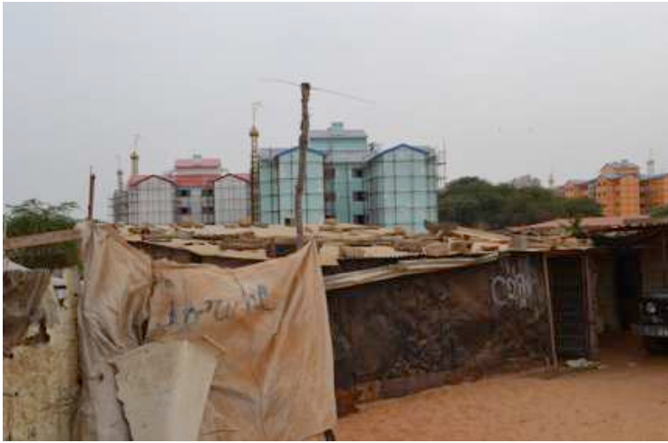
The slum and city in conversation. Luanda, June 2011.

in order to make a claim on the city. The tussle between the imaginations of slum and city were having substantial effects on the form and appearance of the musseque , something that could only be understood if one engaged not only with the clear need to demand land and housing rights, but with the grounded histories of understanding the position of the musseque , the politics of materiality, and struggles over aesthetics that are inherent to a term such as “slum.” A bairro was being built to mark their permanence, their citizenship, but was being shaped by the emergent architectures and urban forms of Angola’s post-conflict building boom. These ordinary urban inhabitants understood the liberatory and oppressive connotations of both the cidade and the musseque very well, and built in conversation with them.