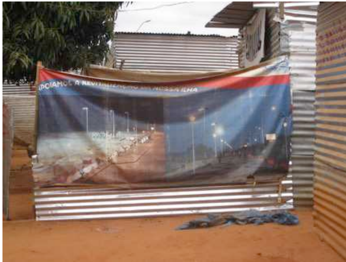
Banner advertising the project for the redevelopment of the Ilha.