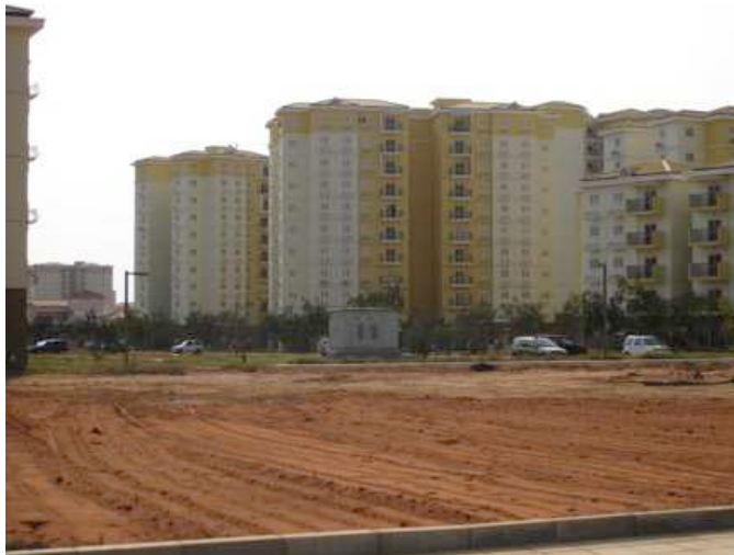
The new satellite city of Kilamba—one of many urban projects that have been implemented since the end of Angola’s civil war in 2002. Photograph by the author, Luanda, August 2012.