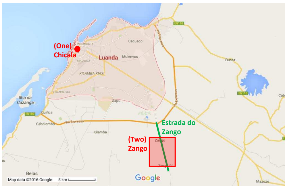
Fig. 3 - Red circle marks approximate location of case area One, Red square marks location of case area Two. Green line indicates approximate location of Zango's main road ( Estrada do Zango ). (Google Maps, 2016)

Zango 1. Currently the 'Zango Project' spreads out on either sides of Estrada do Zango (Zango road) through a linear extension of roughly 10 km towards South. With regards to spatial organisation, although usually the denomination 'Zango' covers a vast area it is numbered in delimited areas ranging from 1 to 5, where the former represents the first constructions and the latter the latest. Given its ongoing expansion it is anticipated that subsequent numbers will be attributed as the built area expands. It is not clear how many houses have been built since the early 2000s in Zango or how many families currently reside in this area. It is known however that in 2014 the construction of 5 thousand "economic houses" in Zango was approved by Presidential Decree (Diário da República, 2014). A result of a contract worth 158.5 million USD celebrated between the government and the company Odebrecht. Furthermore, according to a 2015 press statement, the Angolan government celebrated an 85.5 million Euros contract with the company Alfermetal SA, in order to built 4 thousand "evolving houses" (low-cost houses delivered partially complete) in the area of Zango IV. These would be targeted to accommodate people displaced from so called "risk-areas" (usually referring to informal settlements) within Luanda (OJE, 2015).