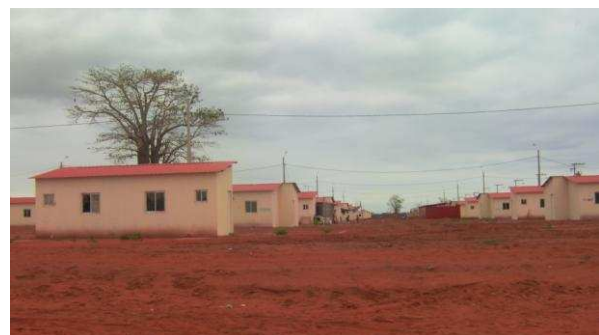
Fig. 5 - Typical street case area Two (Macedo, 2013)