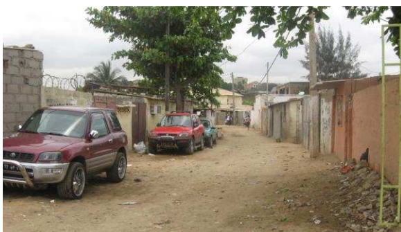
Fig. 4 - Typical street case area One (Macedo, 2011)