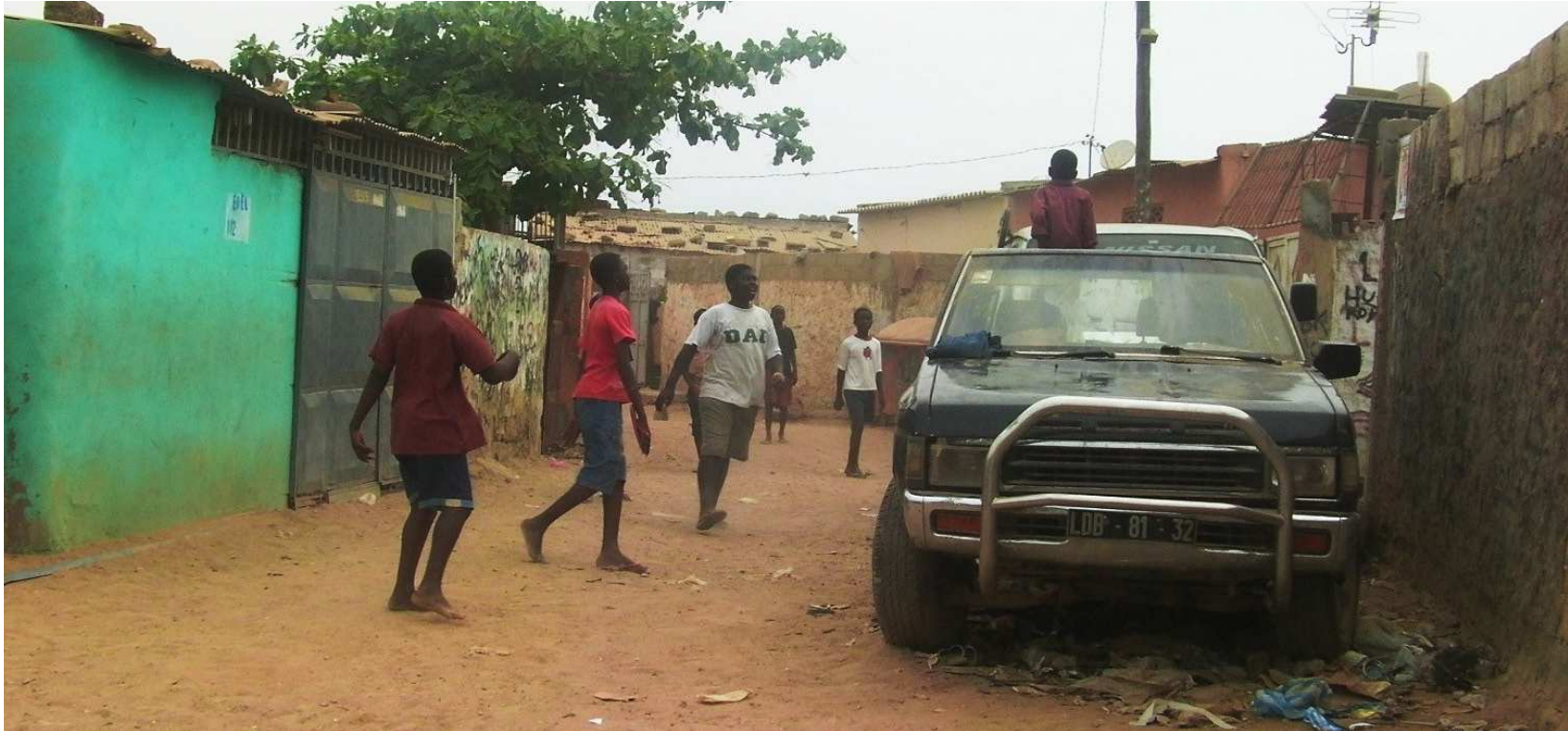
Kids playing in musseque Chicala

The Constitutional Law of Angola's article 85th states that 'every citizen has the right to appropriate housing and to a decent quality of life. It carries on by declaring that the state has the responsibility to 'promote the social and economic conditions to ensure the right to housing and quality of life' (Assembleia Nacional