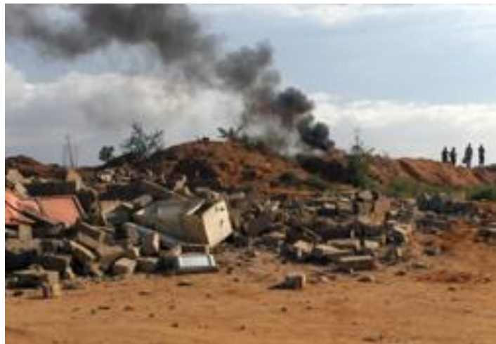
Figure 5. Land-clearance for the first phase of Nova Vida