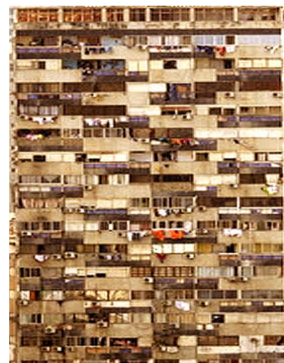
Figure 1. In 1975 abandoned apartments were nationalized; then in 1992 privatised again.

Angola had inherited at independence a government administration and set of laws from a "Statist" Portuguese colonial regime 2 and subsequently adopted a soviet-influenced centrally planned model of management that remained in