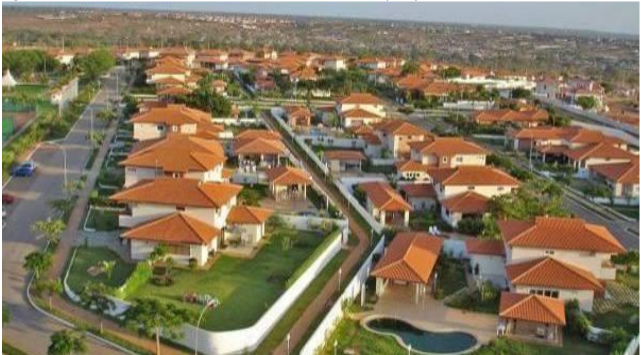
Figure 2. Private Condominium Atlantico do Sul in Belas Municipality Luanda