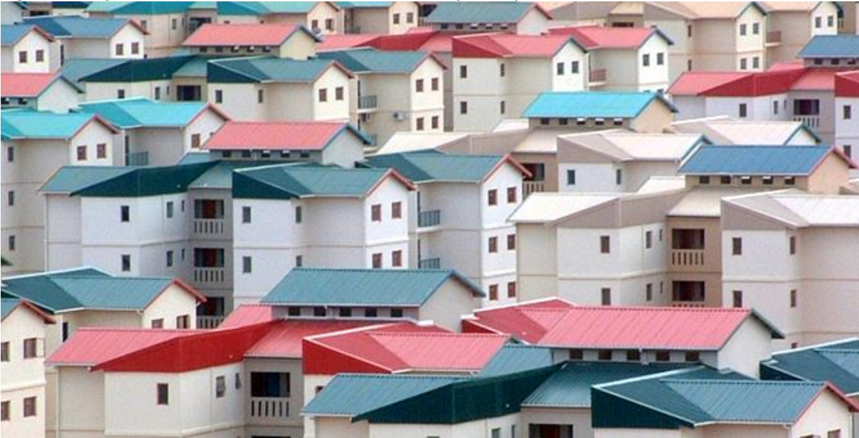
Figure 3. Project Nova Vida in Luanda is a result of the public-private real-estate model

The general manager of the project raised the question of sustainability when the state failed to transfer the management of the project to a private company. Since construction is done using a cost-controlled model, it was possible to maintain the sustainability of the project. The construction of social infrastructure was delayed due to the shortage of funding from the state. He added that the sustainability of a real estate project like this depends on various external factors such as location and the purchasing power of the clients, but in addition, a project such as this must provide the opportunity for the private sector to participate, so that there will be an additional income stream that is not directly related to the sale of homes. For example, the project should build units that can be used for commercial activities and the project should charge slightly higher prices for these 21 .