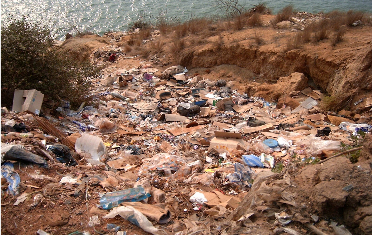
Soares de Costas, de-activated municipal dumpsite, Luanda August 2005

The 2005 DW Scavenger Study was conducted in August of 2005 and set out to examine whether scavenging still occurs in urban Luanda and on its periphery. While illustrating that scavenging activities have shifted to the periphery of the city, this report will also analyze the positions of ELISAL, urban waste management, VIDRUL, as well as multinational and domestic beverage manufacturers in terms of sustainable waste management as it relates to recycling. The trajectory of recycling has been altered since Development Workshops' 1997 Scavenger Study. The death of UNITA's rebel leader in 2002 effectively ended Angola's civil war. This has resulted in Luanda's economy to be able to receive commerce and global flows, in this process many partnerships within recycling have been formed within the informal and formal sector. This 2005 diagnostic study will also detail the process of recycling in the informal sector and formal sector.