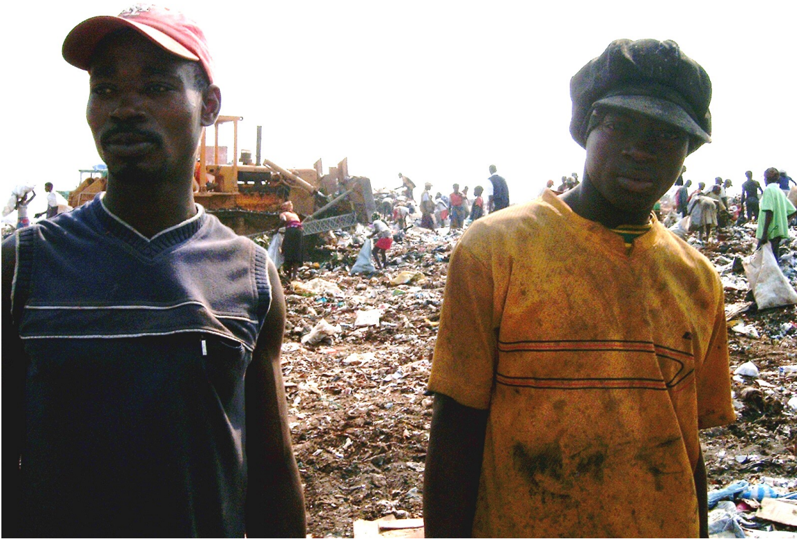
Scavengers at Municipal Dumpsite Golfe II/Gamek, Luanda August 2005

In 2005, Gamek was not only bustling, it was also the only active site of the three studied for the DW 1997 Scavenger Study. The site was visited on more than two occasions; however, due to the tense political climate caused by upcoming elections—in which waste is viewed as a highly sensitive social and political subject—official interviews were only allowed with ELISAL authorization. Over the course of two afternoons DW observed an estimated 250 people scavenging. Of these, 31 were willing to be interviewed; twenty-five males and six females. Most of those interviewed scavenged full time (at least 20 hours a week and at least six days a week). The reusable waste materials scavenged for ranged from glass bottles, dense aluminum, and light aluminum cans for soft drinks to copper, bronze, iron, and plastic. Most of the women observed but not interviewed collected only bottled glass, while men and adolescents scavenged for iron, copper, bronze, heavy and light aluminum, and