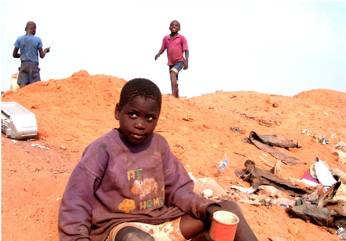
CHILD SCAVENGERS AT LUANDA'S MUNICIPAL DUMP SITE, GAMEK, AUGUST 2005