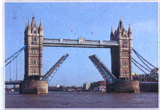
GEOTOURISM: Olympic London