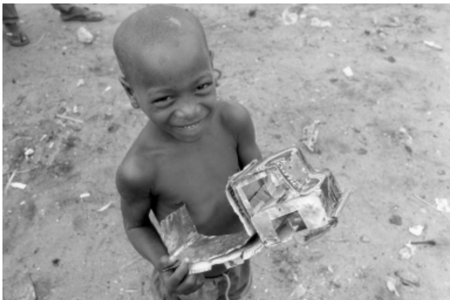
A creative use of Luanda’s rubbish

“When we finish we will do many more things – because there is still a lot to be done.”