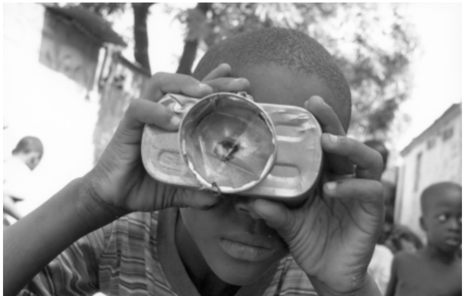
Just a snapshot, but musseque life is far from easy.