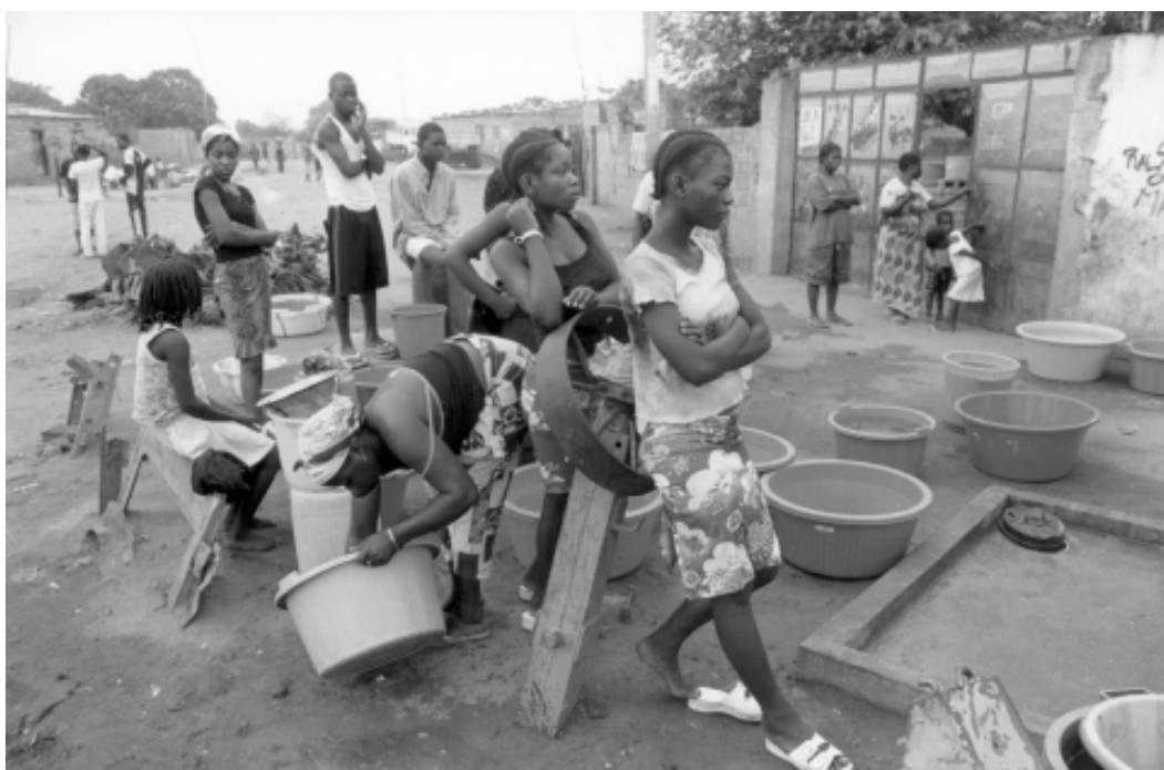
Looking forward to a future without poverty and access to basic services

The LUPP programme, which played a key role in getting the standpoints up and running, is supporting the community as it addresses the wider issue of water flow and other problems in the neighbourhood.