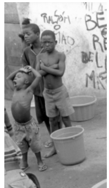
Home sweet home

DW is developing pilot projects in Luanda and Huambo to test different ways of