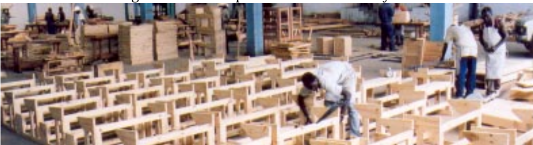
Factory in Huambo now operates as a social enterprise, producing furniture while providing jobs and training

Decentralisation and the determination to build democratic local governance is one of the most significant Angolan Government initiatives since the end of the war. Development Workshop, with its participatory settlements planning skills and community development experience, is uniquely placed to contribute to this Government led programme to eventually reach and rebuild Angola’s 163 Municipalities across the country.