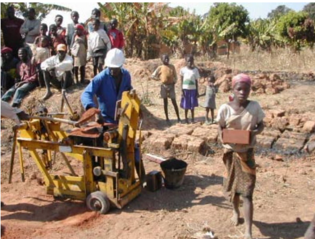
Development Workshop supports Angolan communities to rebuild

In the late 1980s, at a time when Angolan civil society, particularly the church organisations, was beginning to strengthen, DW launched the award-winning "Sambizanga" project to improve water supply, sanitation, and community health for more than 100,000 people in one of Luanda's poorest municipalities.