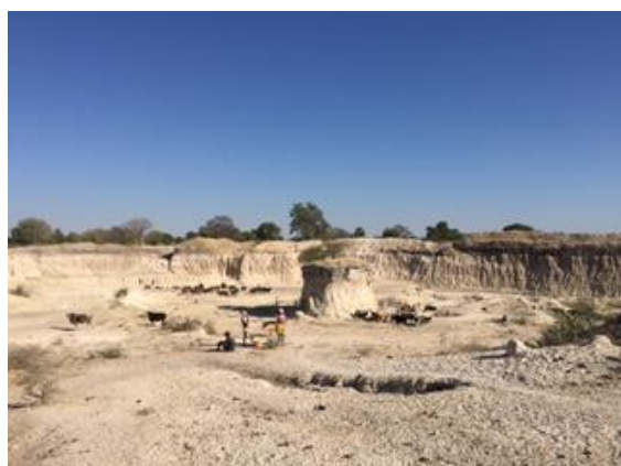
Tchimpaca in Evale, Ombandja Municipality, Cunene Province. Pastoralists are digging wells to water livestock.

This year, the National Institute of Cereals in the Ministry of Agriculture estimates a production deficit of 40%. According to the Provincial Directorates of Agriculture, food insecurity is predicted to worsen from August onward in Cunene and Huila provinces, possibly to be exacerbated by forecasted La Niña that could bring flooding. The market is experiencing severe price increases and fluctuations as a result of the increasing food scarcity. According to FAO, from May to June 2016 an estimated 1 million people remain affected and 400,000 will need food and non-food assistance in the coming months.