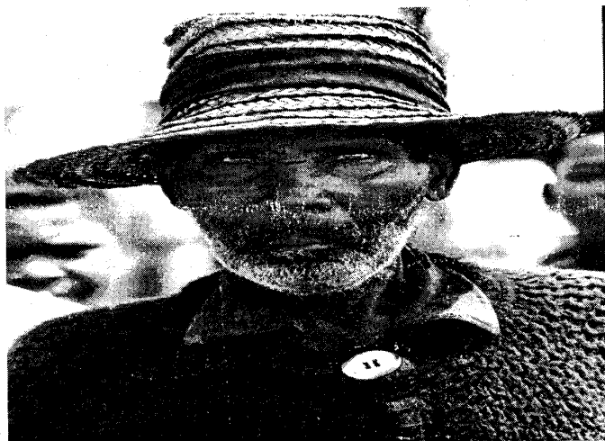
Relief workers are hindered from helping due to the increased insecurity.

The security situation in the country has not shown positive changes during the two first weeks of June. Attacks, ambushes and harassment are still increasing on the ground, particularly in Uige, Bengo, Kwanza Norte, Malange, Lunda Sul, Lunda Norte, Huambo, Huila and Benguela Provinces. Ironically, relief actors are forced to limit their activities while more and more populations are becoming displaced and in need of relief assistance. Unfortunately, humanitarian properties and workers are often the target of attacks and harassment. Consequently, UN agencies and NGOs are withdrawing their staff from unstable localities and reducing their activities to emergency interventions in order to limit the risks for their personnel.